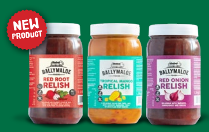
Red Root Relish 1.2kg, Tropical Mango 1.25kg & Red Onion Relish 1.3kg