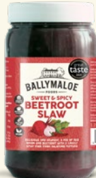
Sweet & Spicy Beetroot Slaw