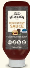
Irish Stout Sauce