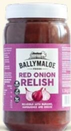
Red Onion Relish