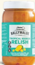
Tropical Mango Relish