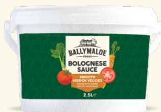
Hidden Veggies Pasta Sauce