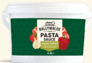
Italian Tomato Pasta Sauce